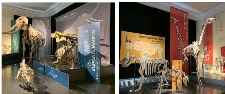
Fig. 10. Details from the Skeletons Room: Enhanced written and visual communication