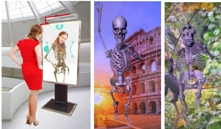
Fig. 9. Augmented reality mirror (MirrorMe) to learn human evolution by mirroring the interactive skeletons of the human body and the chimpanzee