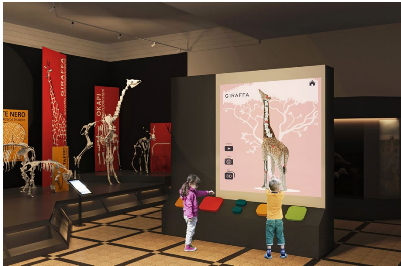
Fig. 4. Skeletons Room transformed into a hybrid reality setting: Real skeletons, interactive animals (e-REAL technology) and 3D reconstructed footprints for tactile exploration