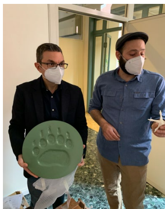
Fig. 5. A representative 3D reconstructed footprint