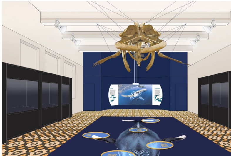
Fig. 7. Initial rendering: Whale Room transformed into a hybrid reality setting with real elements displayed jointly with a multimedia storytelling made interactive by gesture shaping (e-REAL technology)